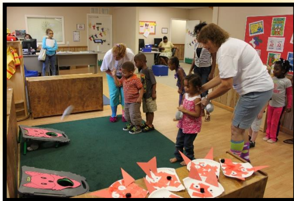
Children's Day 2015