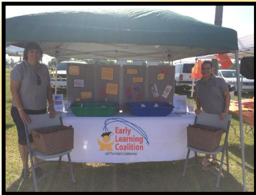
Kiwanis Kids Day 2015