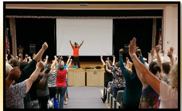
Childcare Provider Conference 2015