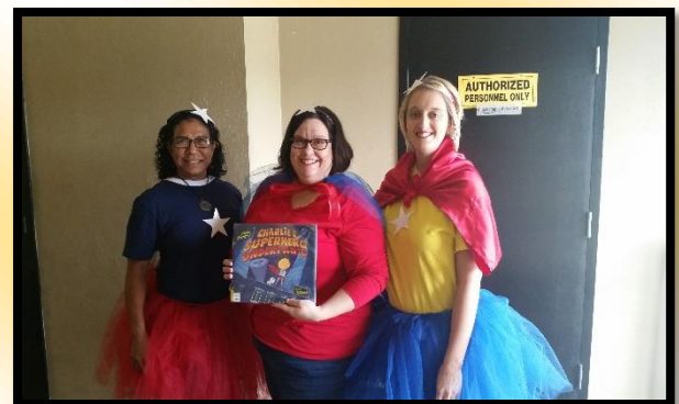
Super Readers 2015